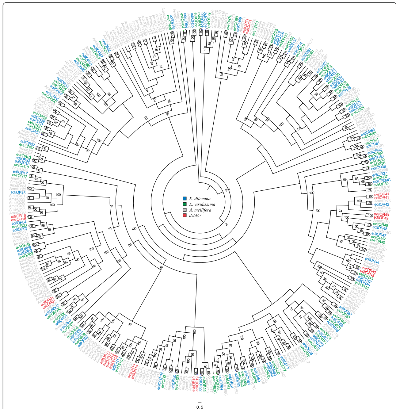
Fig. 1 Phylogenetic relationships of the 86 candidate E. dilemma and 85 E. viridissima Odorant Receptors (ORs) to Apis mellifera . The maximum likelihood tree was rooted by the OR co-receptor orthologs of all three species. Bootstrap values for branches with \geq 50\% support are indicated. ORs marked in red correspond to the 10 orthologs with d_N/d_S > 1 (Table 2; see main text for details). Symbols after the OR descriptors: C: C-terminus is missing, N: N-terminus is missing, F: gene model was manually assembled, P: pseudogene (after [54])

This resulted in an elevated mean d_N/d_S for the chemosensory loci (0.91 vs. 0.12 for the NC gene set; Fig. 2a; Table 2) indicating relaxed purifying and/or increased diversifying selection on chemosensory genes. Although mean d_N/d_S was smaller than 1 for both gene sets, we detected 12 chemosensory receptors (10 ORs and 2 IRs; Table 3) and 23 NC genes with d_N/d_S > 1 (Fig. 2b; Table 2;